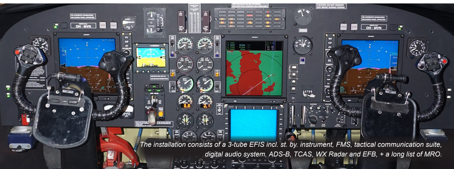
The installation consists of a 3-tube EFIS incl. st. by. instrument, FMS, tactical communication suite, digital audio system, ADS-B, TCAS, WX Radar and EFB, + a long list of MRO.