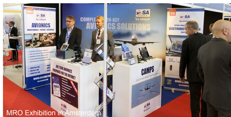
MRO Exhibition in Amsterdam

http://www.scanav.com/capabilities/product-development/