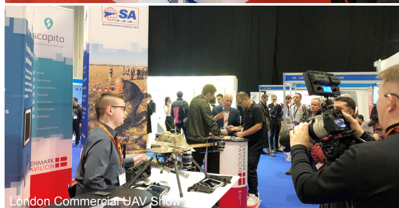
London Commercial UAV Show