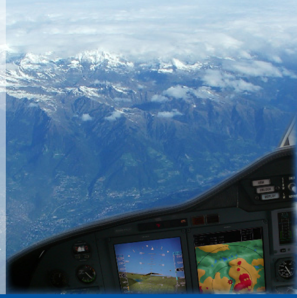
Complete Turn-key EFIS Solutions