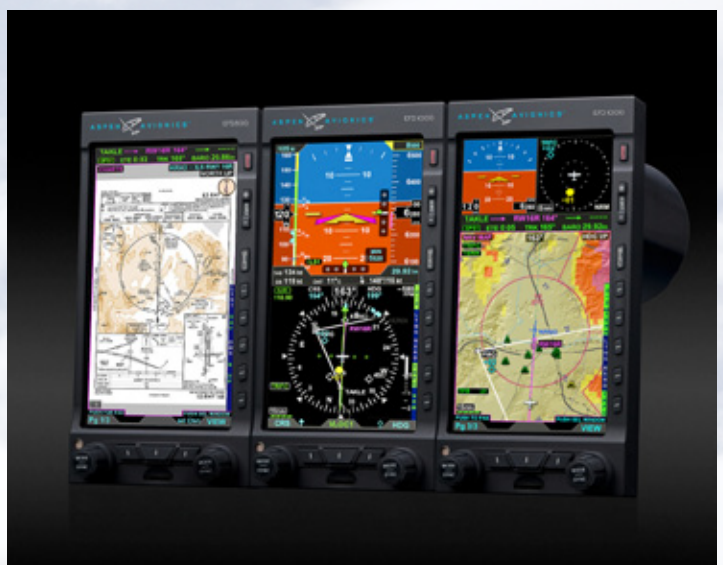
Evolution Flight Display System from Aspen Avionics

For more information, please feel free to contact us or visit www.scanav.com .